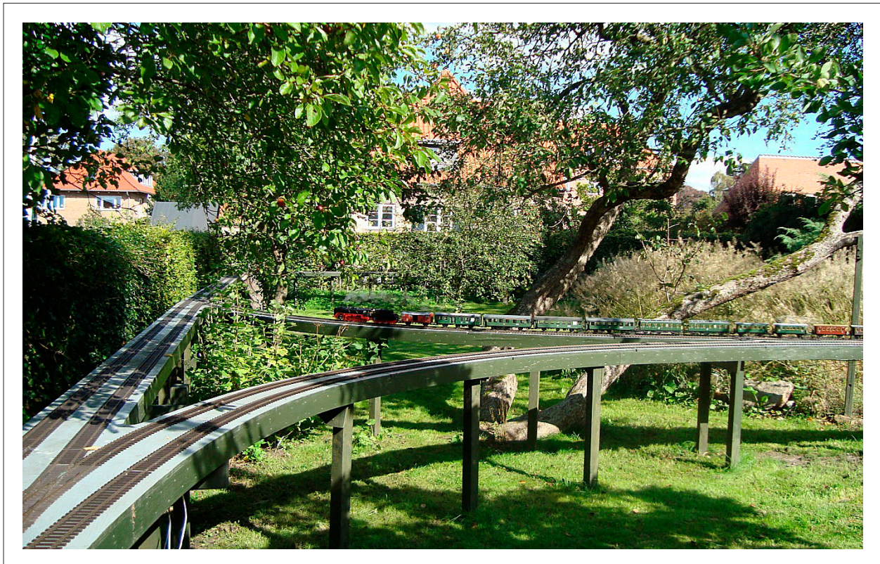
The triangle connection between circleline and the express mainline.