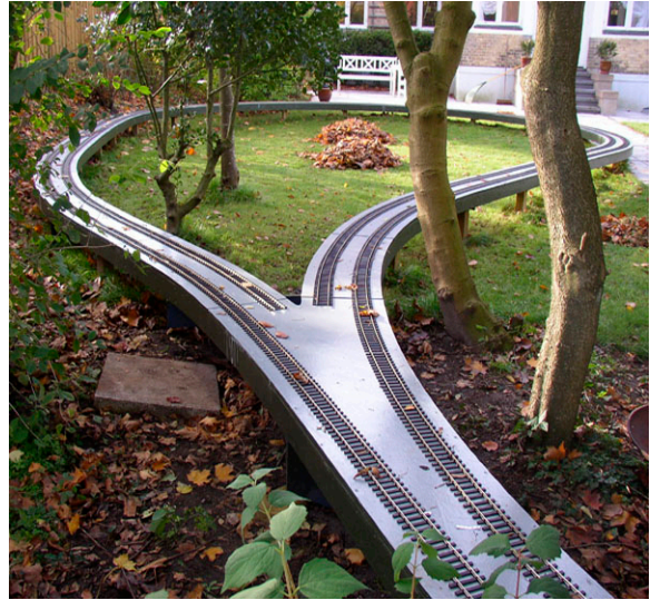
The south end of the express mainline ("folded bone")

Running on the track is naturally free. Food and refreshments can be bought on the day at very reasonable prices.